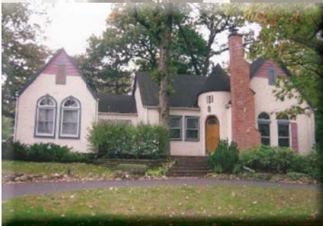
Walter LaBuy House, Built 1923-1924