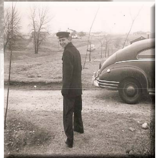
Background Image: 1969 Sign at Hilltop and Algonquin Roads by Fred Kruse, Superintendent of Roads