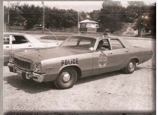
1973 'New' Dodge Police Car