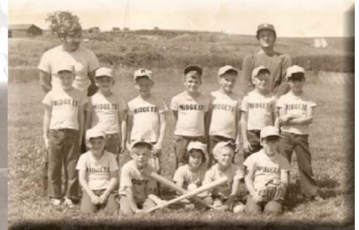
Lake in the Hills 1975 Midget Baseball Team. Photo looks north toward the Fen.

Photos Courtesy of the Lake in the Hills Historical Society