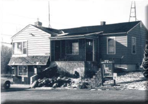
First Village Hall and Police Station